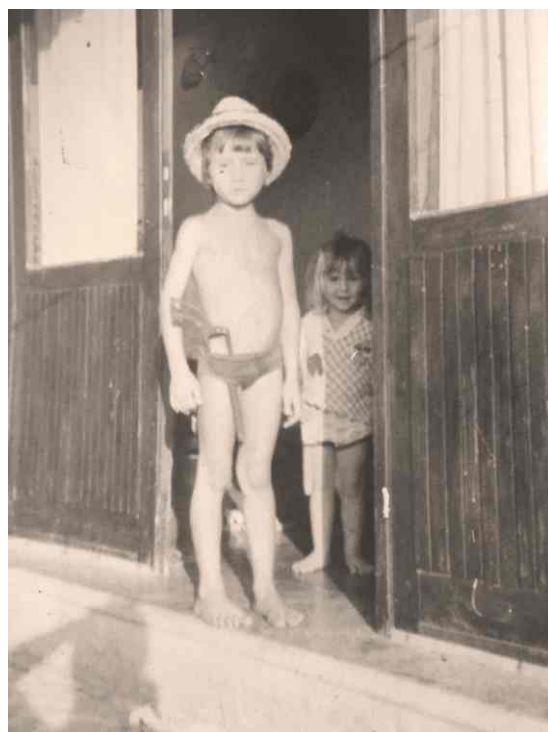
“Batu & Banu” Yacht Classic 1983