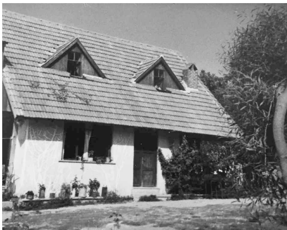
Yacht Classic 1970